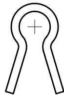
SHOWN AS SUPPLIED