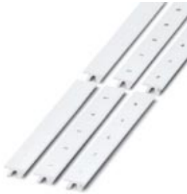
Zack marker strip, white, For terminal block width: 15 mm

Please be informed that the data shown in this PDF Document is generated from our Online Catalog. Please find the complete data in the user's documentation. Our General Terms of Use for Downloads are valid ( http://download.phoenixcontact.com )