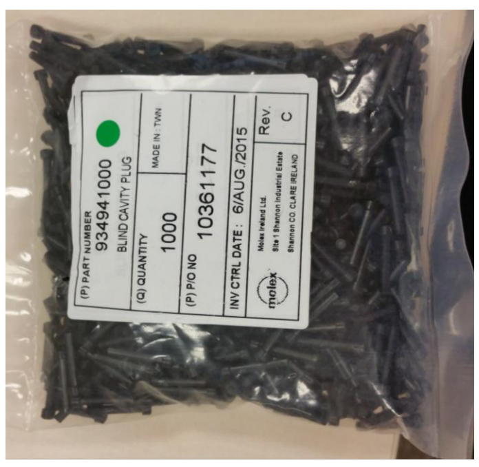
Figure 2: Vendor Label on Bag

The recommended quantities of parts are placed in the bag. The bag is then heat sealed and a standard Molex label is placed on the outside of the bag. The label must adequately describe the product details and factory order information.