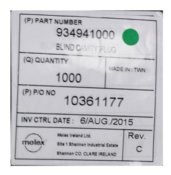
Figure 4: Vendor Label Sample (69.0 x 69.0mm)