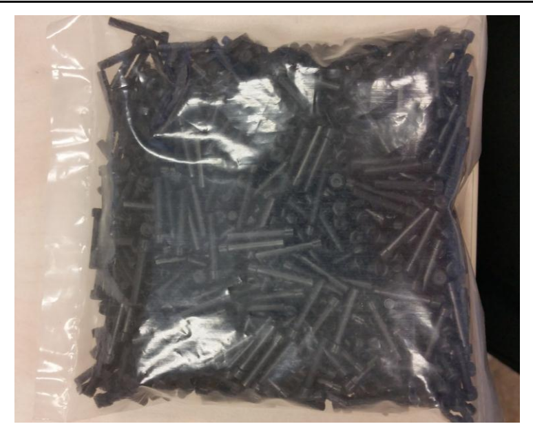
Figure 1: Parts Placed in Bag