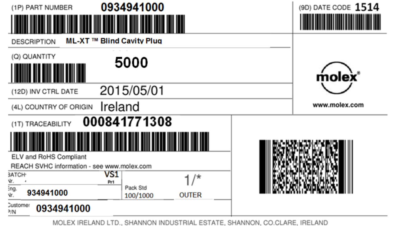
EX INCERIO ETD., OF INITION INDOOTHING COTATE, OF INITION, OC. CENT

The Molex labels to be used are the standard Molex Ireland labels (127.0 x 76.2mm).