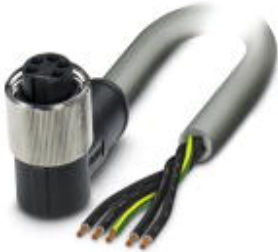
Power cable, 5-pos., gray PUR/PVC, 2.5 mm 2 , free cable end to angled 7/8" 16UNF socket, length: 5.0 m

Please be informed that the data shown in this PDF Document is generated from our Online Catalog. Please find the complete data in the user's documentation. Our General Terms of Use for Downloads are valid ( http://download.phoenixcontact.com )