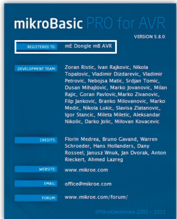
Figure 1-2: mikroBasic PRO for AVR® About Window