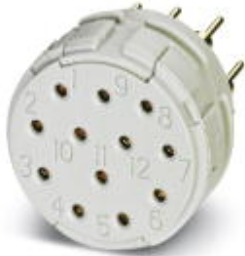
Contact insert, Number of positions: 17, Type of contact: Socket, Solder-in connection

Please be informed that the data shown in this PDF Document is generated from our Online Catalog. Please find the complete data in the user's documentation. Our General Terms of Use for Downloads are valid ( http://phoenixcontact.com/download )