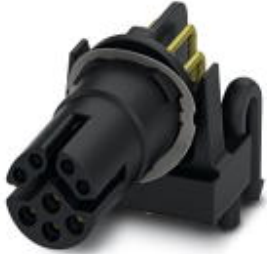
M12 panel feed-through, rear mounting

Hybrid contact carrier, Ethernet, 8-pos., rear/screw mounting, with angled solder connection