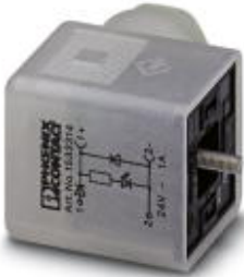
Valve connector, 3-pos., type A, 1 LED, with protective circuit, screw connection, cable screw connection Pg9

Please be informed that the data shown in this PDF Document is generated from our Online Catalog. Please find the complete data in the user's documentation. Our General Terms of Use for Downloads are valid ( http://download.phoenixcontact.com )